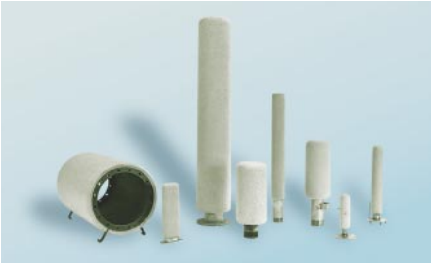
DURATHERM™ Burner: Typical Single Piece and Segmented Cylindrical Configurations.