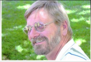
Sidel Systems SRU Flue Gas Condenser

Sidel Systems has been designing and installing high efficiency hot water heating systems since 1978 ...long before the natural gas pricing crisis we are in today.